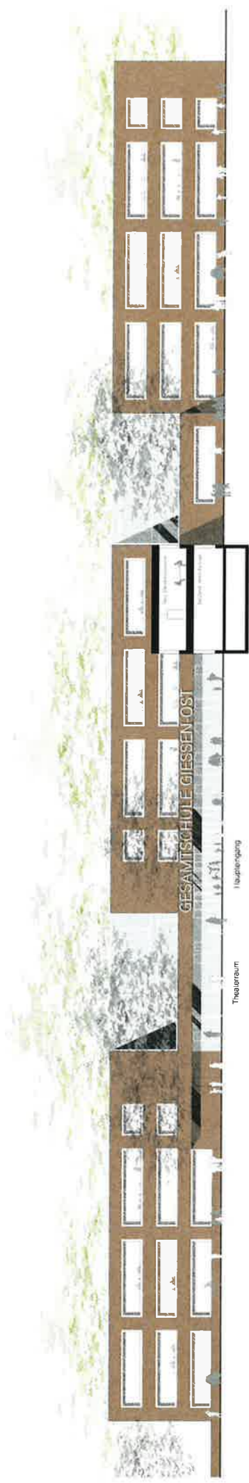
Ansicht Nord 1:200